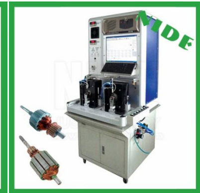
Rotor testing machine