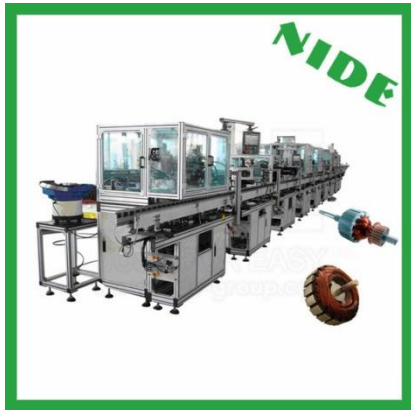
Rotor assembly line with belt