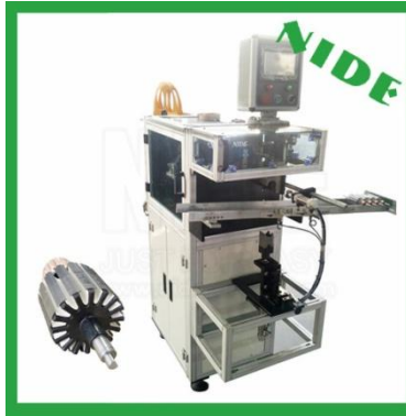
Paper inserting machine