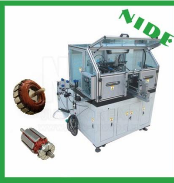
Armature winding machine