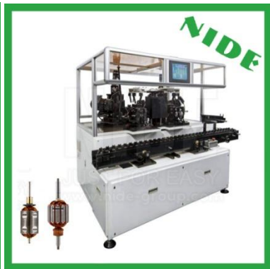
Armature balancing machine