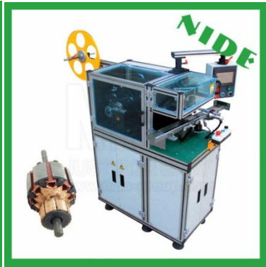
Wedge inserting machine