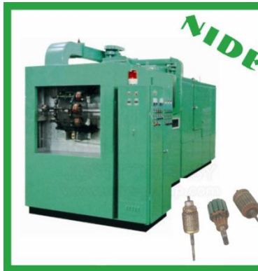
Armature varnish machine