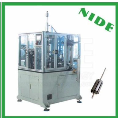
Commutator pressing machine