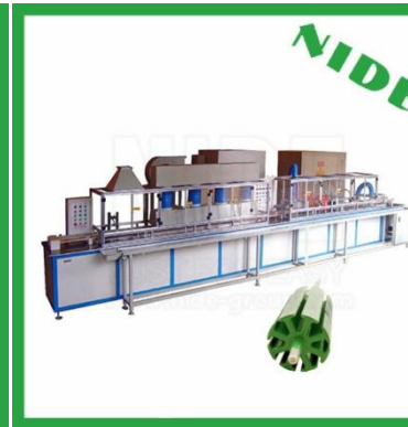
Powder coating machine