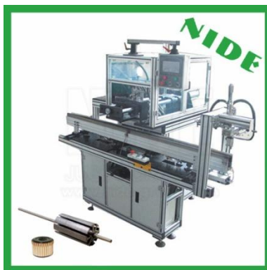
Shaft inserting machine