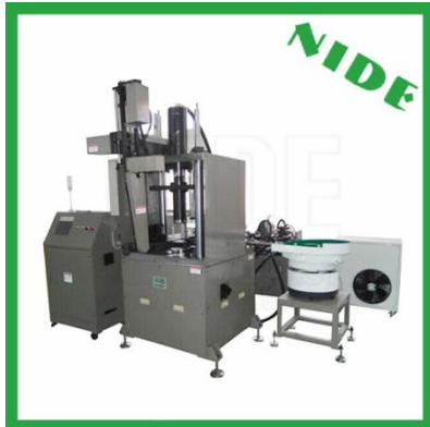
Rotor die-casting machine