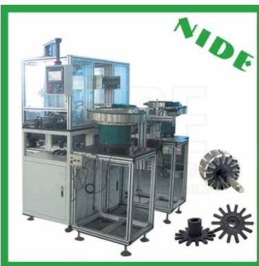
End cover pressing machine